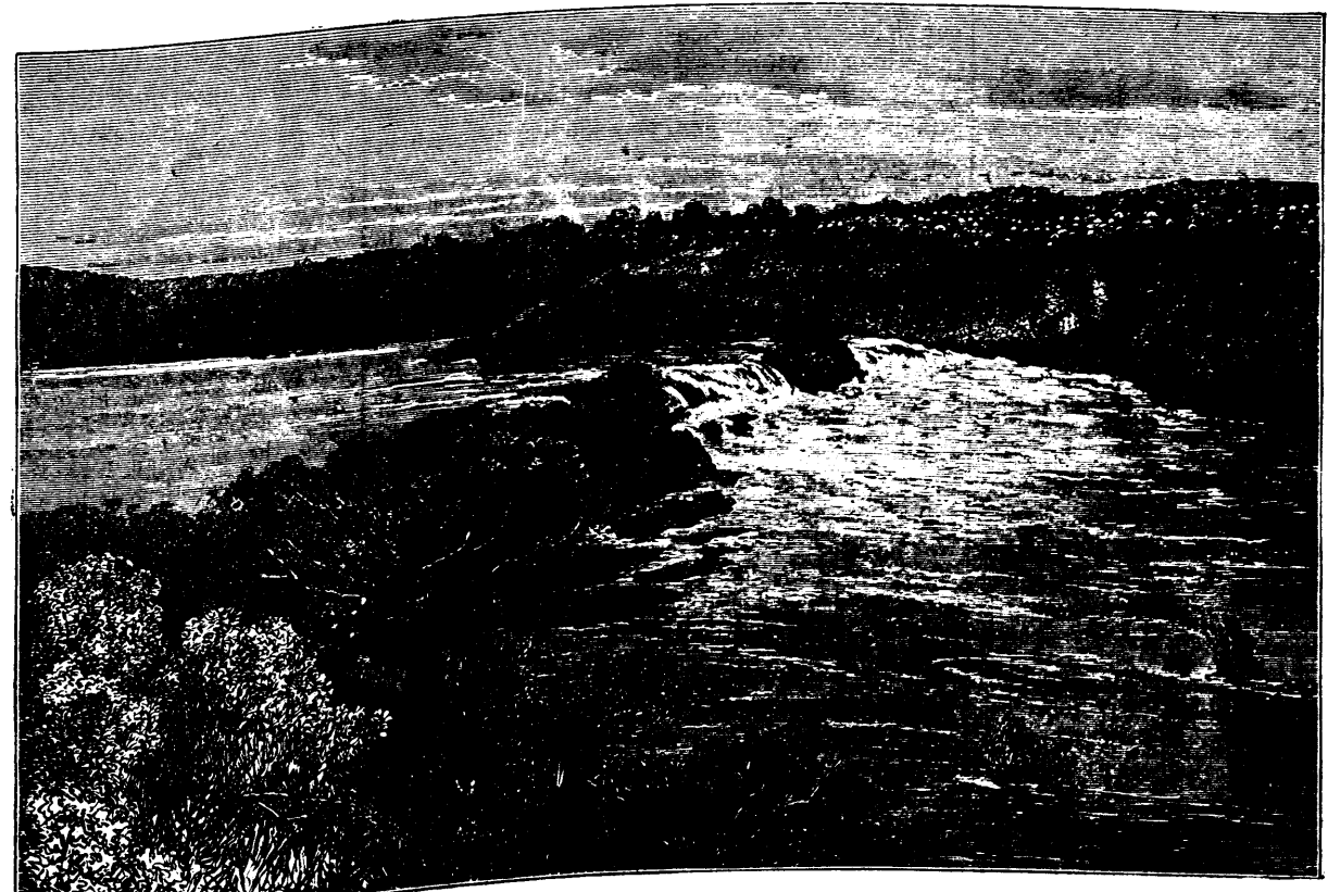
VICTORIA NYANZA : BIPON FALLS, WHICH GIVE BIRTH TO THE VICTORIA HILL. CAMP OF BEAR-GUARD ON HILL. OUTFALL OF THE

to march, more than half of this expedition will