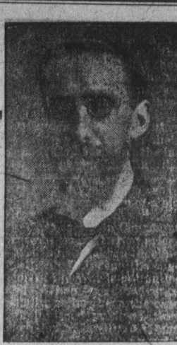
SIR GEORGE E. FOSTER