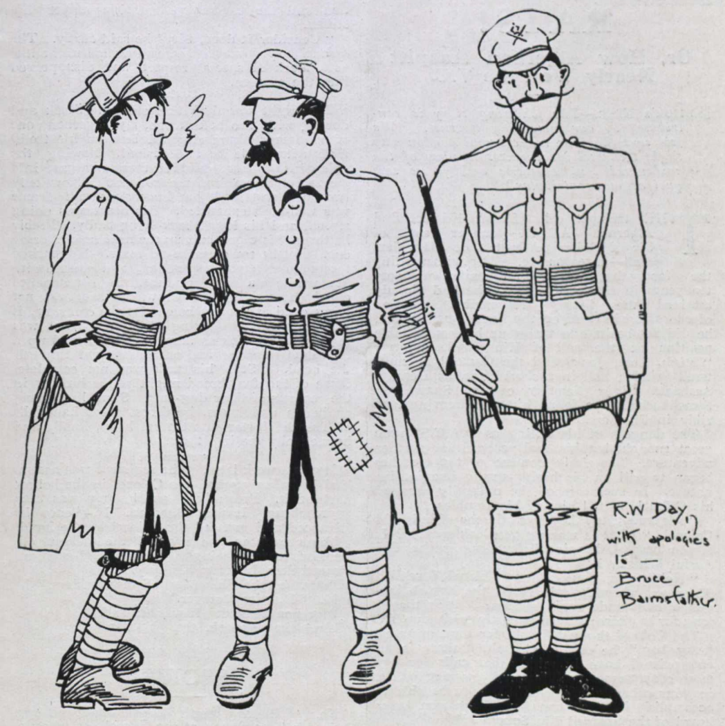
If "Old Bill" and "Bert" attended the C.C.S. Old Bill: "Bert, I really think it is safer in the trenches!"