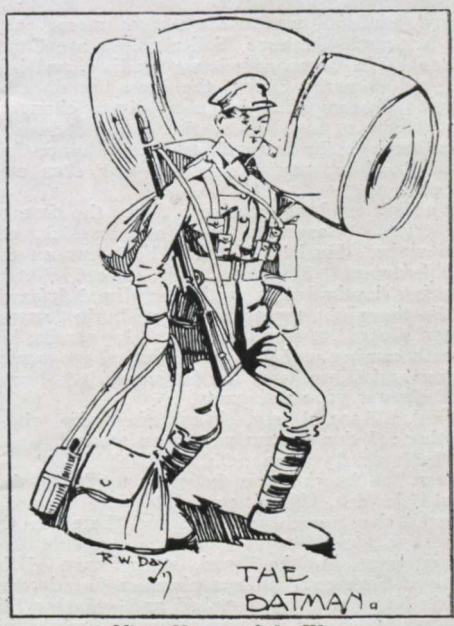
Minor Heroes of the War.

Who watches while I clean the swill. Parades me when I need a pill, And takes my name for extra drill? The Sergeant.