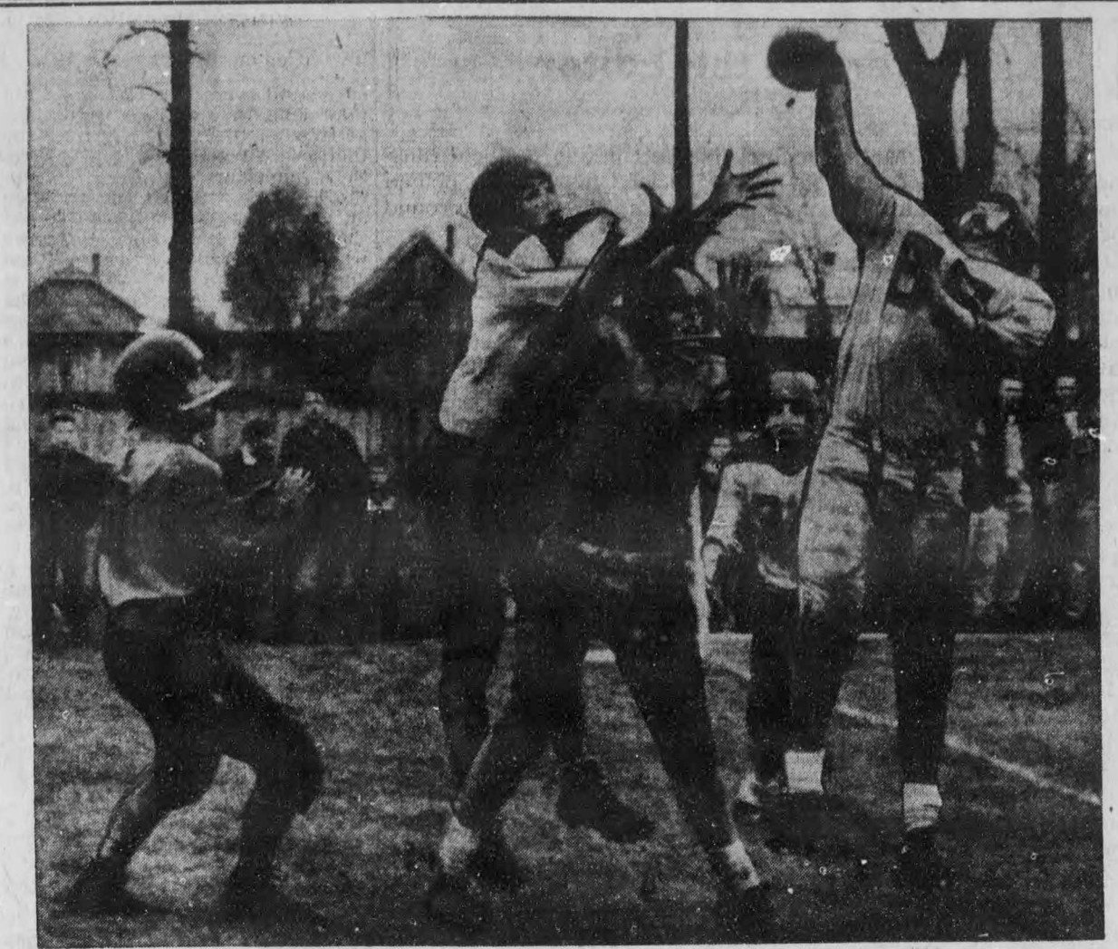
Bombers game. On yesterday's game in Saint John, rests the decision of whom faces Mounties - Bombers game. At press time, the Brunswickan had no information on the score. The Mounties, who defeated Setunday. At press time, the Brunswick in the Nova Scotia - New Brunswick in the Nova Scotia - New Brunswick play-offs, were defeated Saturday, 40-18 by Shearwater.