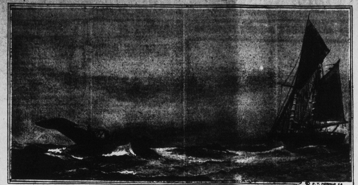
This striking picture, drawn especially for this newspaper, the New York Herald and the London Sphere, shows a neutral fishing vessel going to the rescue of German aviators, who fell with their Taube into the North Sea. Both men were exposed several hours to the cold water and one of them was suffering consideraby from shock and chill when rescued. Several similar incidents have been reported from the North Sea.

NEUTRAL VESSEL RESCUING GERMAN AVIATORS WHO FELL INTO NORTH SEA