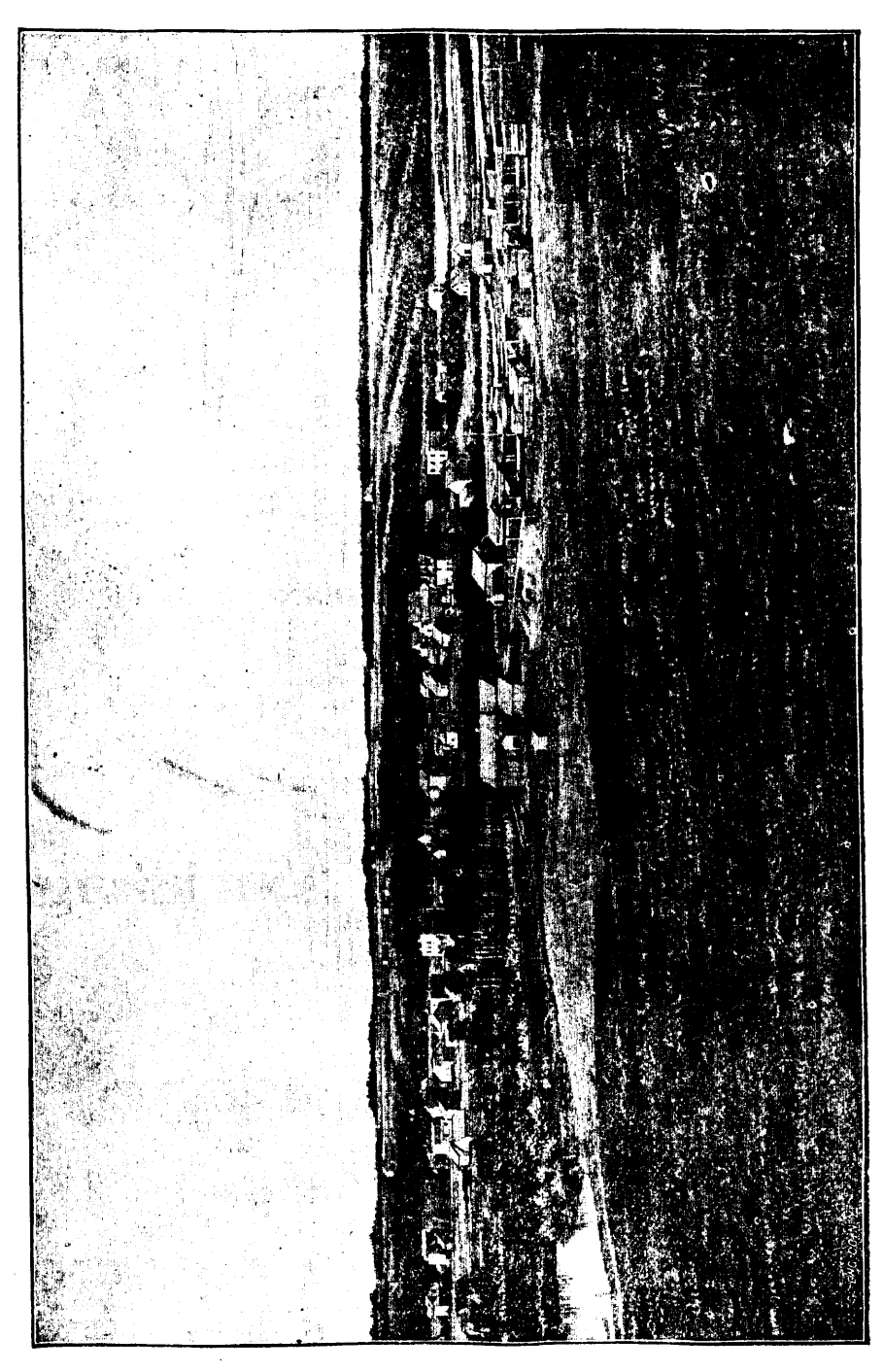
BIRTLE, ON THE LINE OF M. &, N. W. RAILWAY.