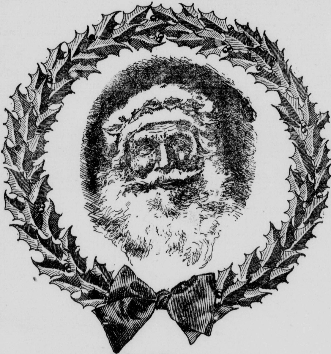
The Man of the Hour