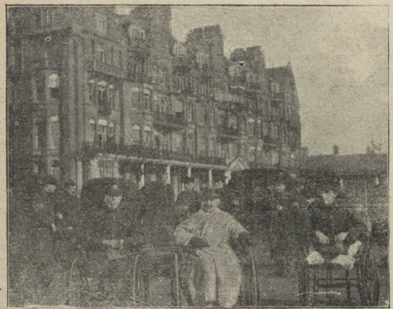
The Home where Many Hundreds of Wounded Canadians have been Restored to Health