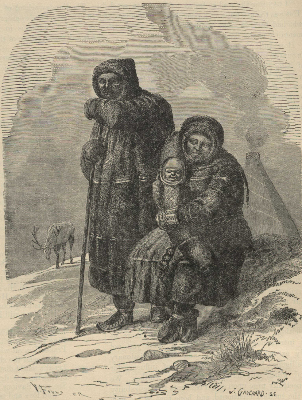
A LAPP FAMILY.