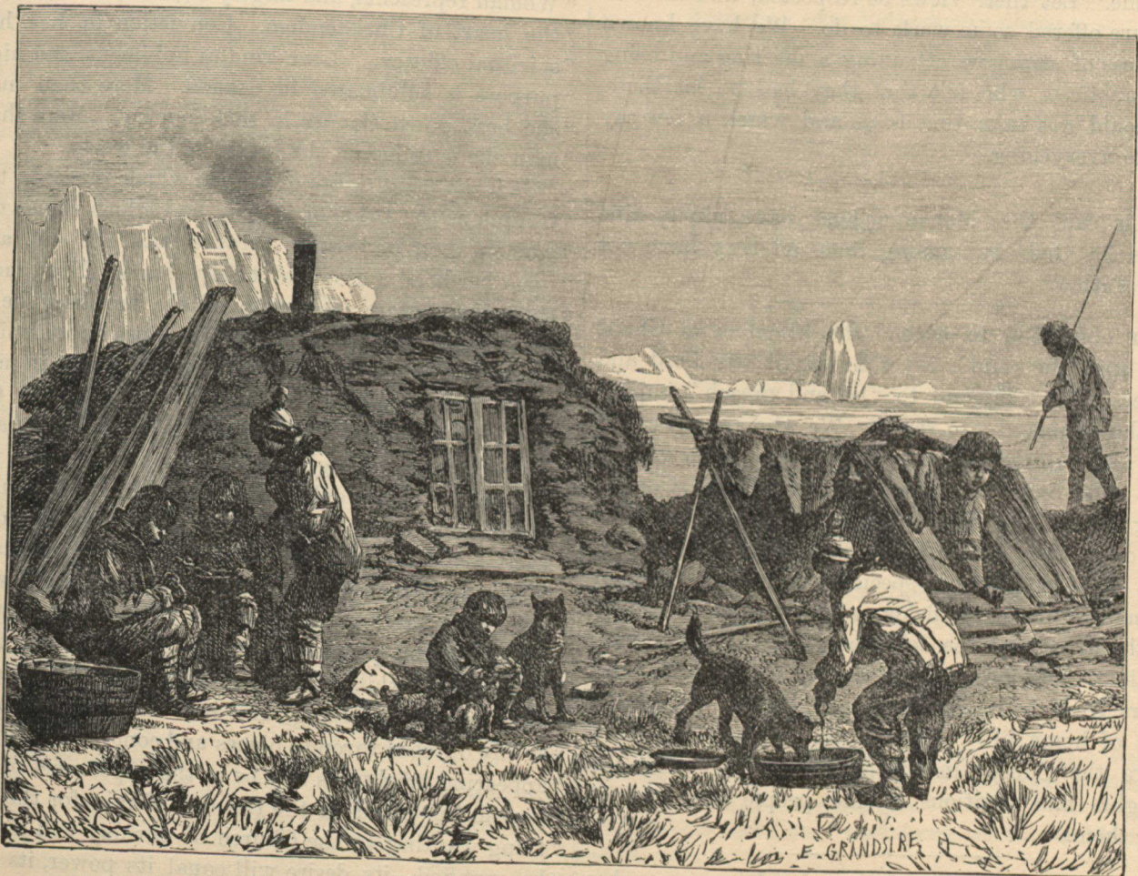
AN ESKIMO HOUSE—COAST OF LABRADOR.