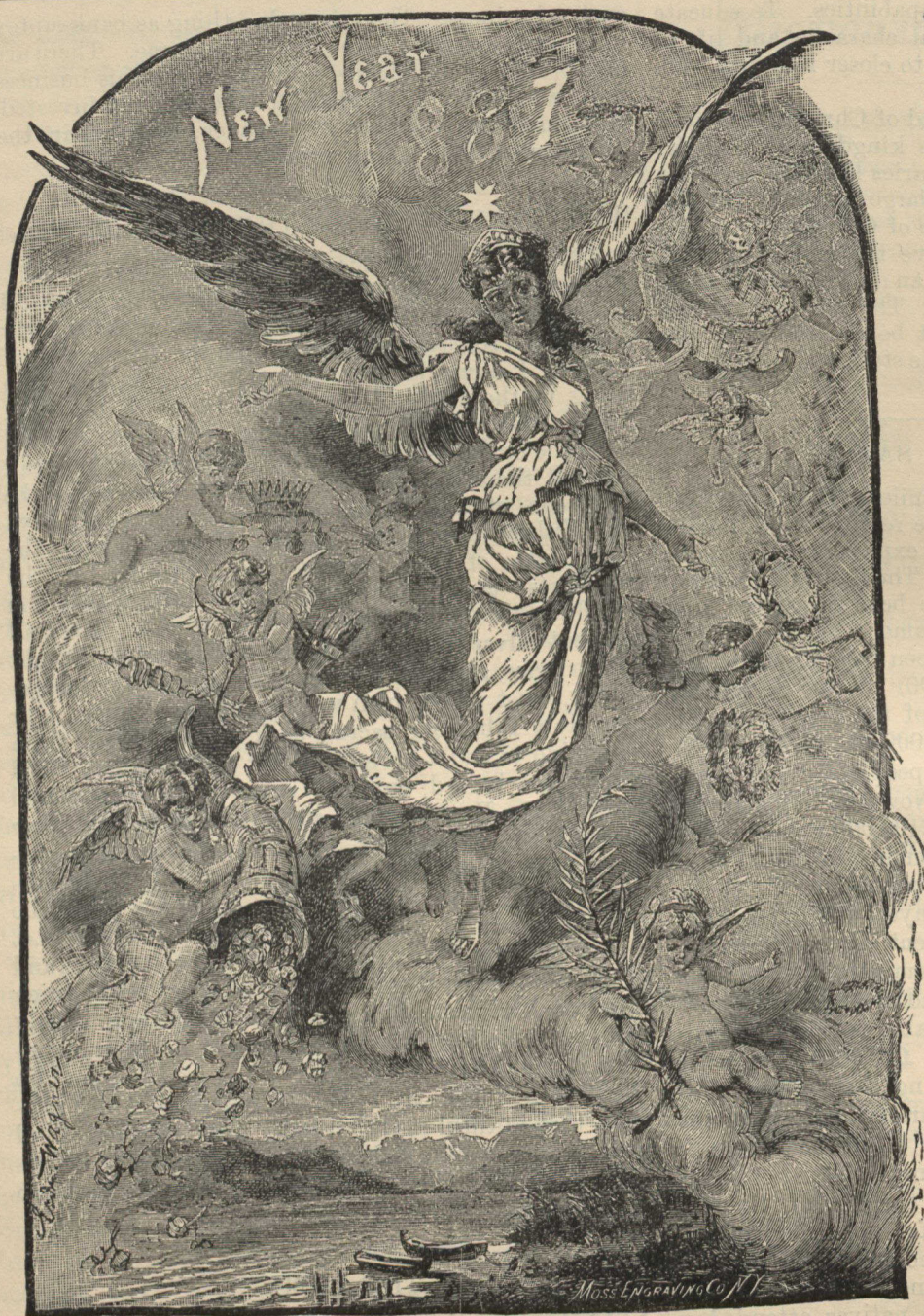
"A HAPPY NEW YEAR."

is a circle—symbol of spirit and form, of eternity and trinity. In Nirvana, the highest heaven of the saints, Buddha sits on a lotus flower; so, too, the idol of their creation—the monster Buddha-image, which is sixty-nine feet high.