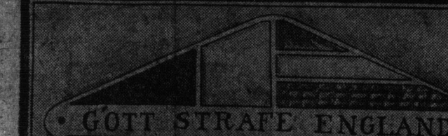
One of the famous Hated Brooches, now worn by millions of Germans.