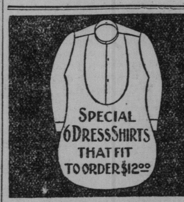
Exclusive Shirt Makers 68 King St. West, Toronto.

with its strings of Drums, Bugles. Animals, Sleighs, etc., gracing the galleries above you to pay us a visit. Bring the children, it will do their little hearts good and incidentally