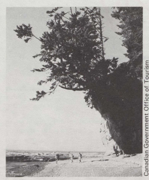
Visitors to the park walk beneath unique tree formation.