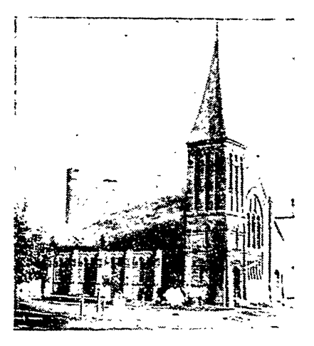
The present Church Building Opened January, 1831

May 15, 1888, the fine church building that had been erected only eight years before, was destroyed in a conflagration that also burned up a number of fine residences, a roller rink, a skating rink, and other buildings. The church, by the loss, was left homeless, with a debt of about $5,000.00. It was thought by some that under such a crushing disaster, the church would be wiped out, but it was not so to be.