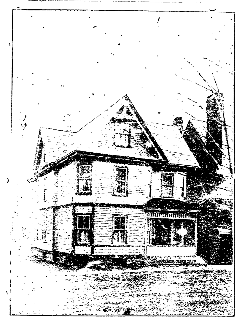
The Parsonage (crected 1904)