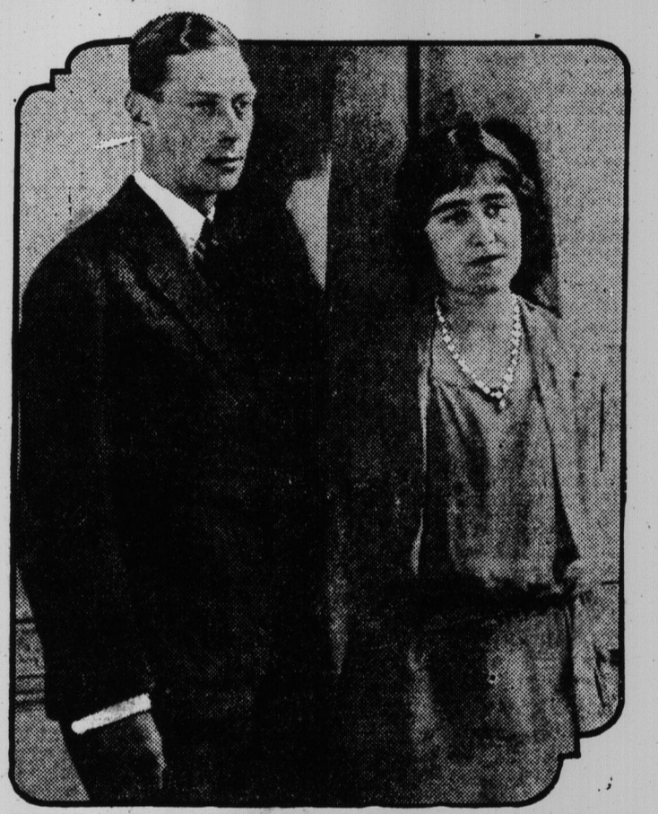
DUKE AND DUCHESS OF YORK sail today from Portsmouth on H. M. S. Renown for Australia, where the King's second son will formally open the new capital, Canberra. They will be away for six months.