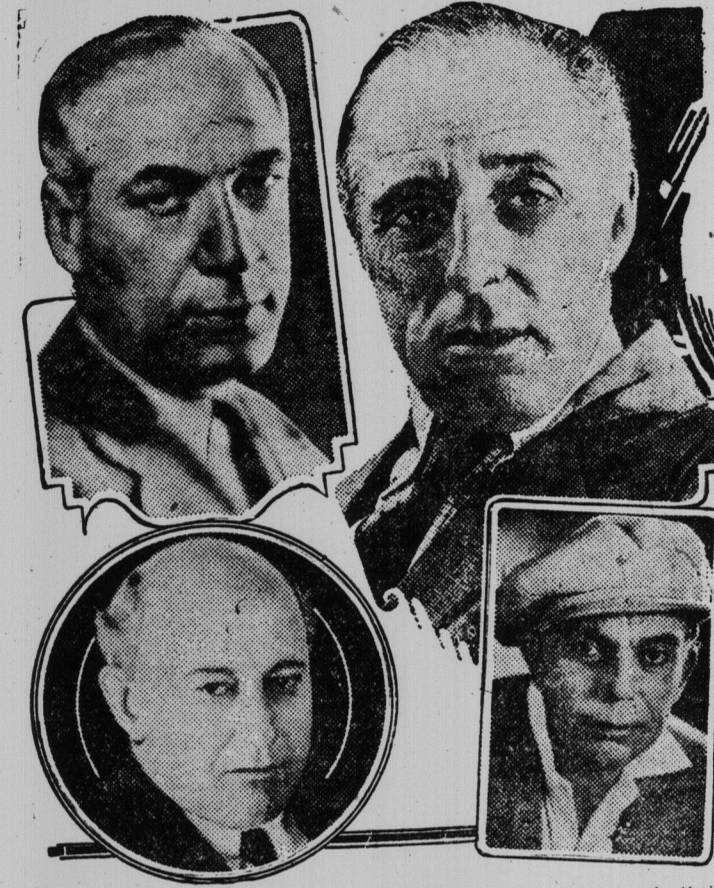
These four directors of movies weren't born with gold spoons in their mouths. They are: Edwin Carewe and D. W. Griffith (above), and Cecil B. DeMille and James Cruze.