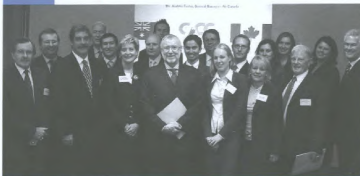
Attendees at the launch of the Canadian Australian Chamber of Commerce in Sydney.

Sydney, Australia > The Canadian Australian Chamber of Commerce (CACC) was launched on October 20 in Sydney, at a luncheon hosted by Australia's Macquarie Bank. The CACC is a not-for-profit organization whose sole focus is to increase the level of trade and investment between Australia and Canada.