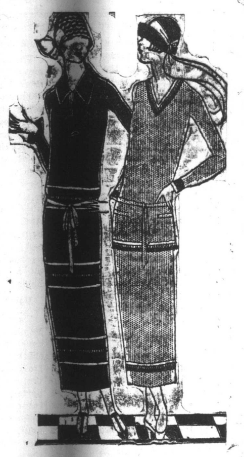
Styles for Women Styles for Misses' Styles for Children