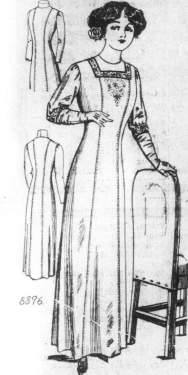
Ladies' Princess Dress with High Square Neck Opening, and with Two Styles of Sleeve.

White silk poplin, with embroidery in pastel tones or blue chiffon cloth with Persian banding would be very effective for this model. The design may be closed invisibly at the side front, or side back, and has a puff sleeve to the elbow, or may be finished with the one piece long sleeve, both of which are furnished. The pattern is cut in six sizes: 32, 34, 36, 38, 40, 42 inches bust measure. It requires 5 1/2 yards of 44 inch material for the 36 inch size.