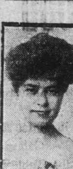
Interesting human document to-day.