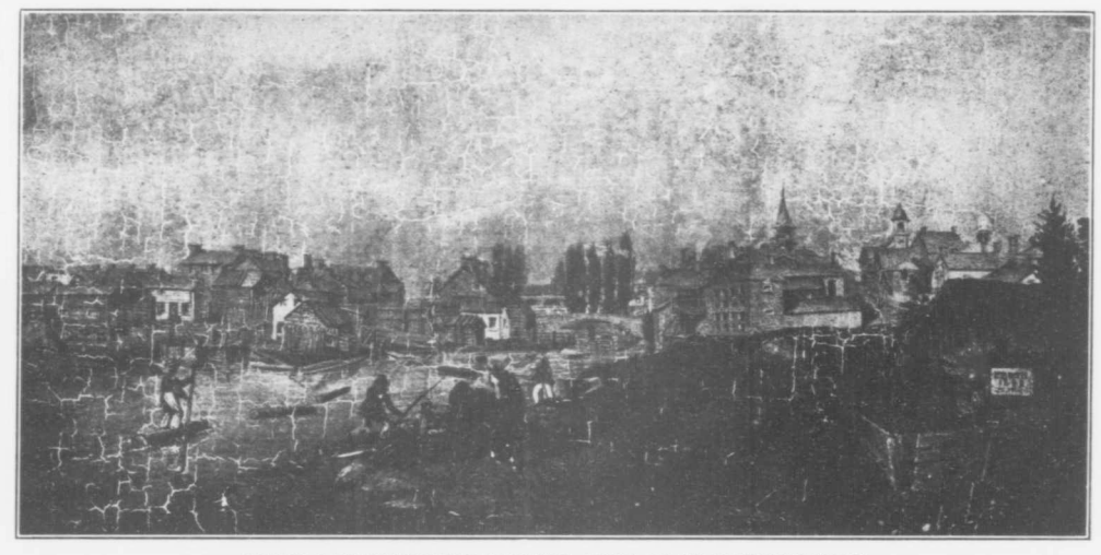
PERTH. LANARK COUNTY, ONTARIO.-FROM AN OIL PAINTING IN 1852.

Perth, the county seat of Lanark, was settled in 1815-16, principally by British officers and soldiers who had served in the war of 1812 and been retired on half-pay, with grants of backwoods land. The town and the Tay river, on which it is located, were named from the home in Scotland of the first arrivals. It is surrounded by a rich agricultural country, connected by the Rideau canal with Ottawa and Kingston, and by rail with Montreal and Toronto. It has a thrifty population of 5,000 and all the modern conveniences.