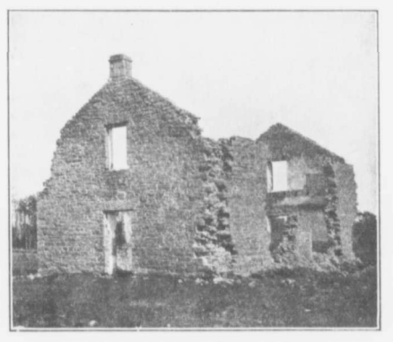
RUINS OF THE STONE CHURCH.

Presbyterian ministers in that city. He supposed the trip would be somewhat of a vacation, his first in a dozen years. At Bytown the home, as the cholera was raging in Montreal. He replied: "I have two daughters there, it is my duty to go, and God will not forsake me." He stayed in the afflicted city two months, preaching every Sunday and ministering continually to the plague-