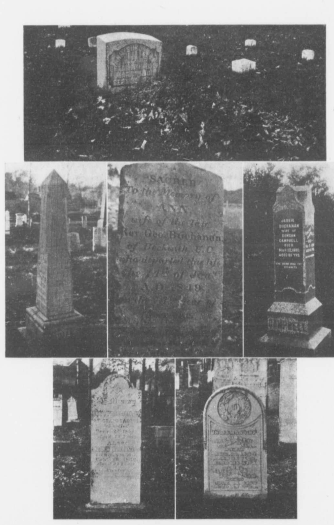
THE GRAVES OF A HOUSEHOLD.