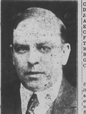
HON. W. L. MACKENZIE KING.