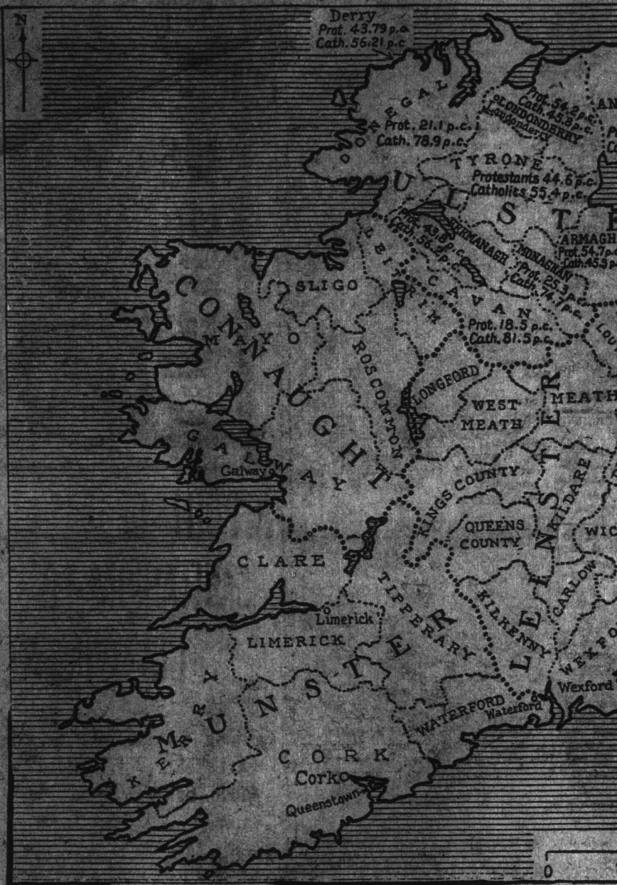
MAP TO ILLUSTRATE THE PROPOSALS TO ULSTER THE CATHOLIC AND PROTESTANT MAJORITIES IN THE ULSTER COUNTIES

Our map shows (1) the position of the Ulster counties in relation to the rest of Ireland, and (2) the percentages of Roman Catholics and Protestants in them.