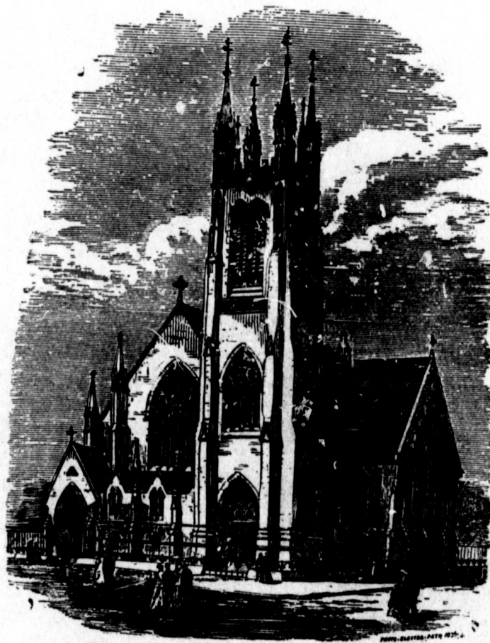
ST. PAUL'S CHURCH, MONTREAL.