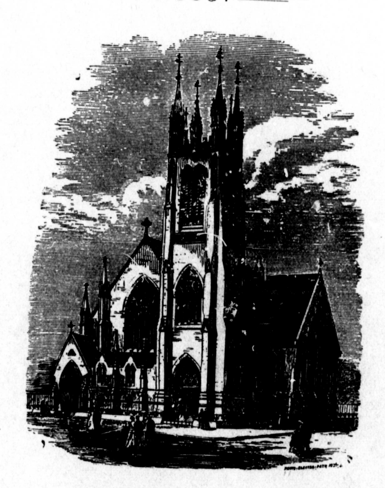
ST. PAUL'S CHURCH, MONTREAL.