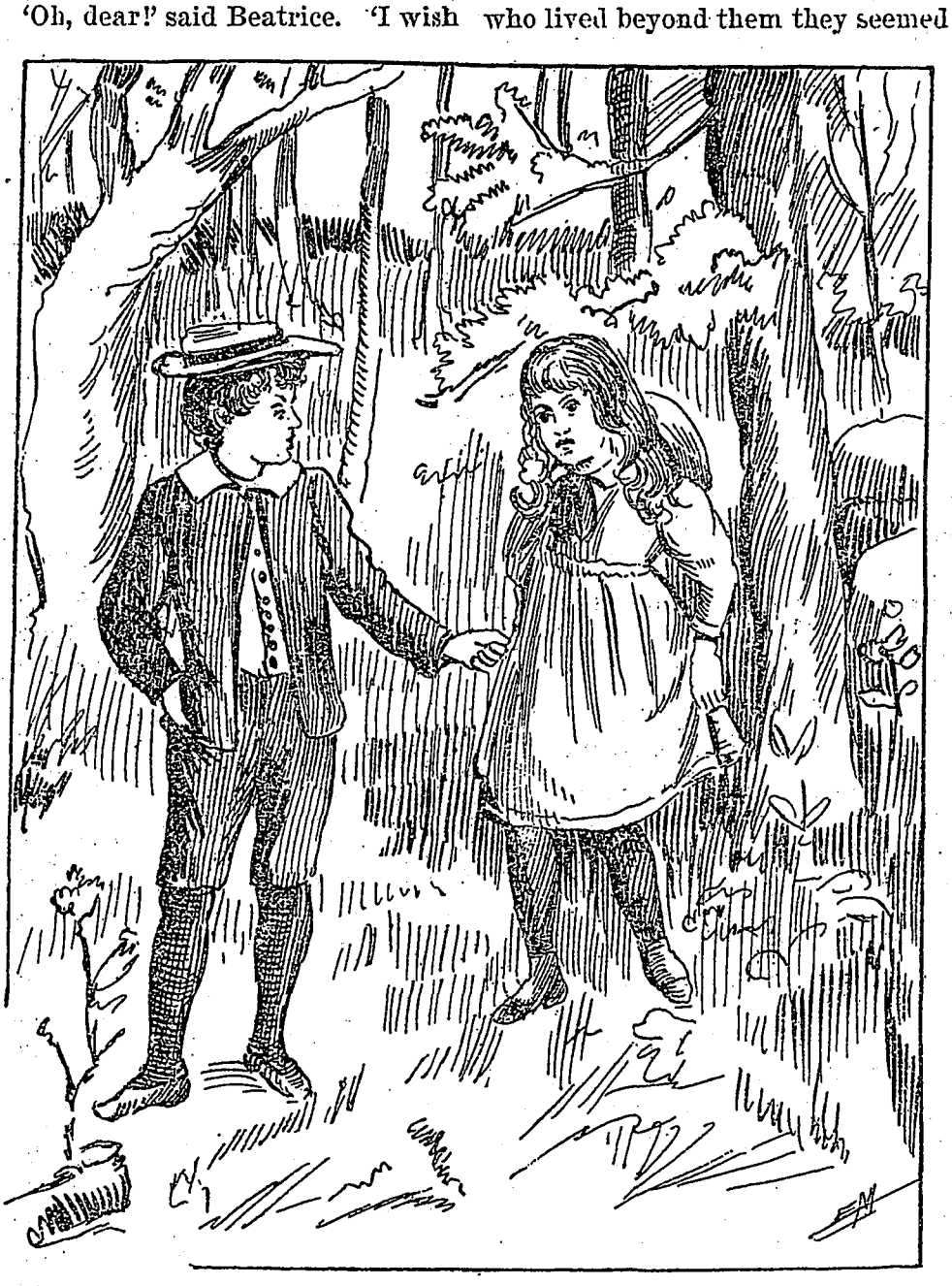
'IF WE MEET A LION WE CAN CLIMB UP A TREE.'

'Let's go into the woods,' said Jimmie. 'Way in.'