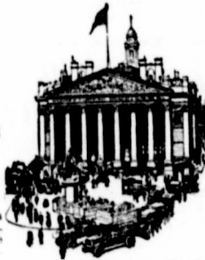
Head Office: Royal Exchange, London

Correspondence invited from responsible gentlemen in un- represented districts re fire and casualty agencies