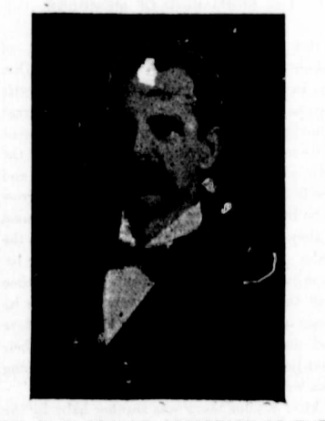
DOMINION ALLIANCE FOR THE TOTAL SUPPRESSION OF THE LIQUOR . TRAFFIC.

Mutual forbearance should be your motto. By its exercise you avoid much that is disagreeable, and cement closer the bonds of brother-