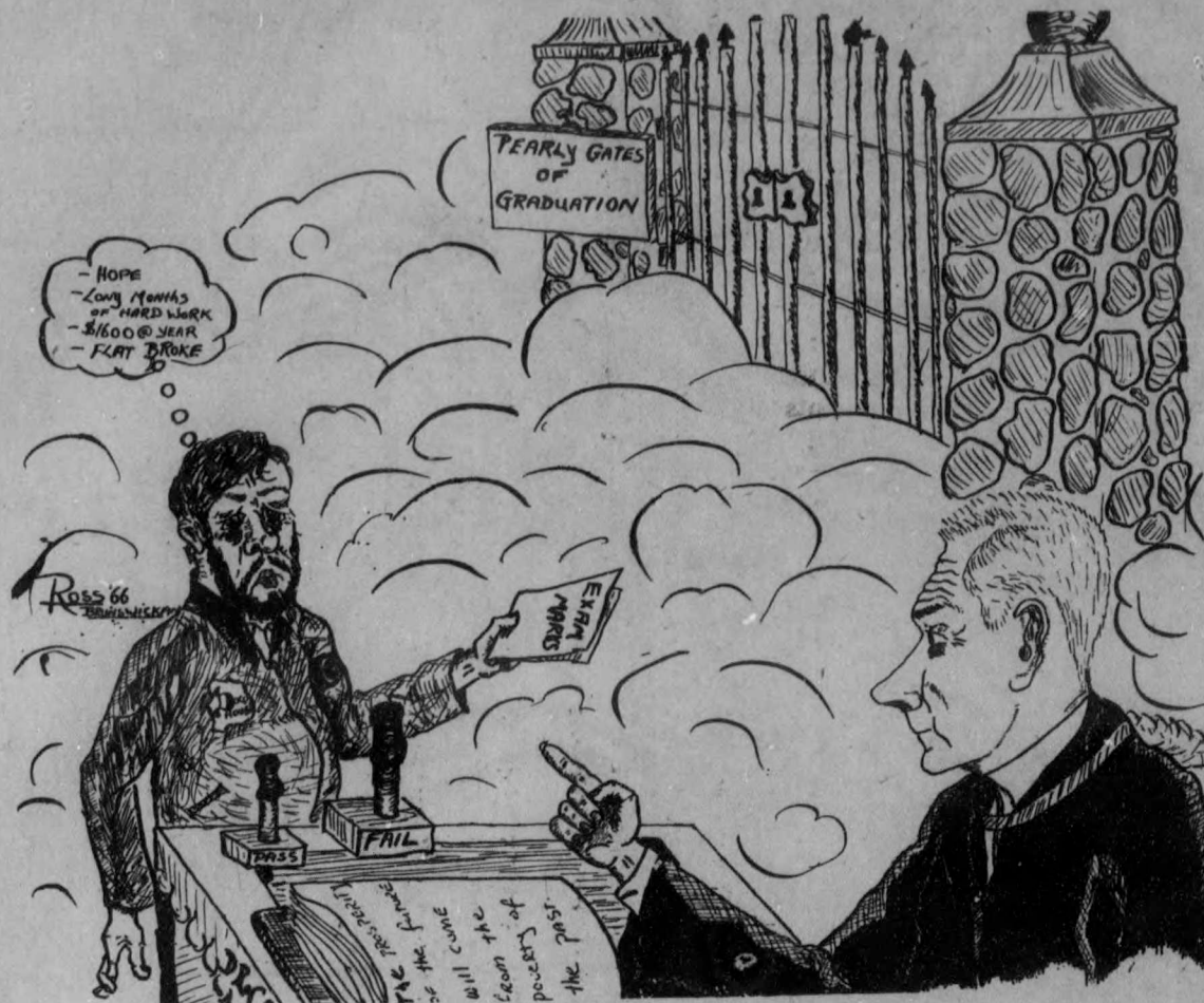
THERE ARE ONLY 35 DAYS LEFT!!

Personal to Burla: Next week — we promise!!