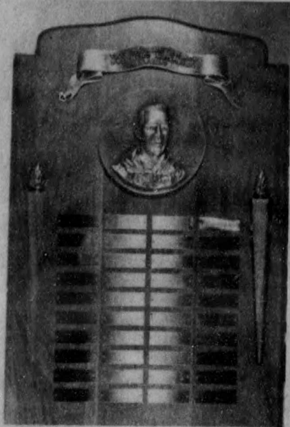
GIL LEACH MEMORIAL TROPHY