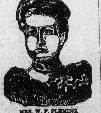
MRS. W. F. FLEMING.

New York, June 2.—A special to The Herald from Cambridge, Mass., says: Mrs. Wilhelmina Paton Fleming, who has achieved fame through her discovery of stars in connection with her