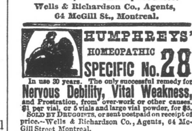
Chart Scnt Free. CVIES-Fevers, Concestions, Inflammation, A.A.—Spinal Meningitis, Milk Fever. B. B.—Strains, Lameness, Rheumatism. C. C.—Distemper, Nasul Discharges, D. B.—Bots or Grubs, Worms. E. E.—Congles, Heaves, Frounche. G. G.—Miscarriage, Hemorrhages. H. H.—Urinary and Kidney Diseases. I. I.—Eruptive Diseases, Mange. J. K.—Discases of Digestion. Stable Case, with Specifics, Manual, Witch Hazel Oil and Aledicator, $7.00 Price, Single Bottle (over 50 doses), - GO Sold by Druggists; or Sent Prepaid on Receipt of Price, Wells & Richardson Co., Agents,

HUMPHREYS' FATHIC VETERINARY SPECIFICS For Horses, Cattle, Sheep, Dogs, Hogs, Poultry. 500 PAGE BOOK on Treat ment of Animals and Chart Sent Free.