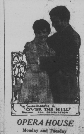
OPERA HOUSE Monday and Tuesday