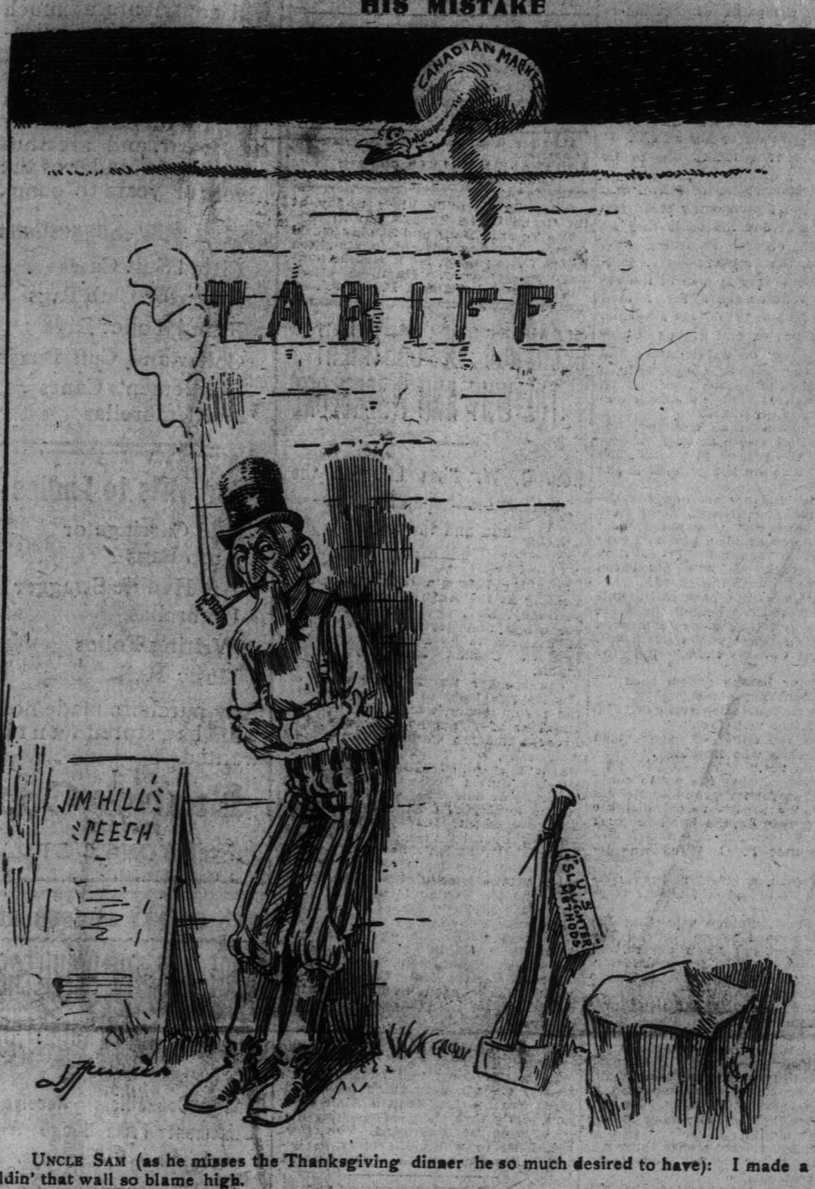
UNCLE SAM (as he misses the Thanksgiving dinner he so much desired to have): I made a mistake buildin' that wall so blame high.