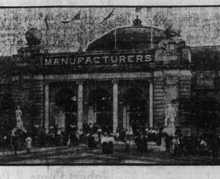
Main Entrance to Manufacturers' Building Showing the Handsome Statury.

Manufacturers Day Draw an Appreciative Attendance of 55,000 in a Splendid Weather. The manufacturers, the men who are responsible for the making of most of the things we need, had their day at the exhibition yesterday, and there is no doubt that they were well pleased with the program of the fair. They are quietly critical in seeing the best that the other fellow can do, and they gain ideas, the outlet of which is to be evidenced at next year's fair.