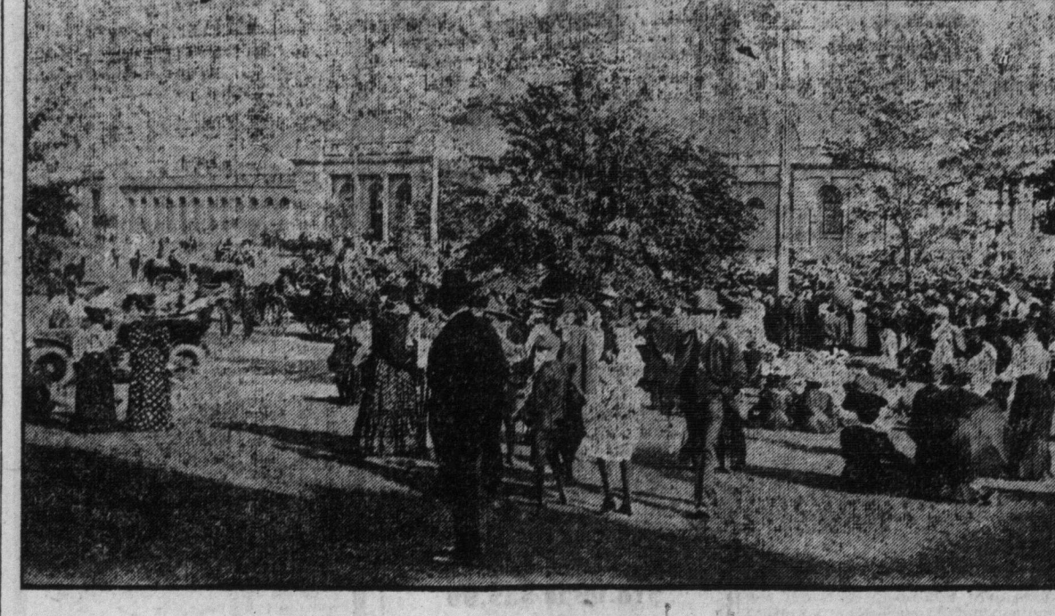
Manufacturers' Building—With Crowd Listening to the Irish Guards Band Yesterday.