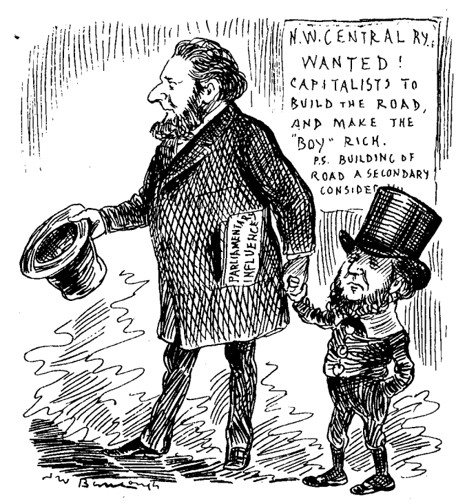
"SOMETHING FOR THE BOY, KIND GENTLEMEN-A MERE TRIFLE OF HALF A MILLION OR SO!"