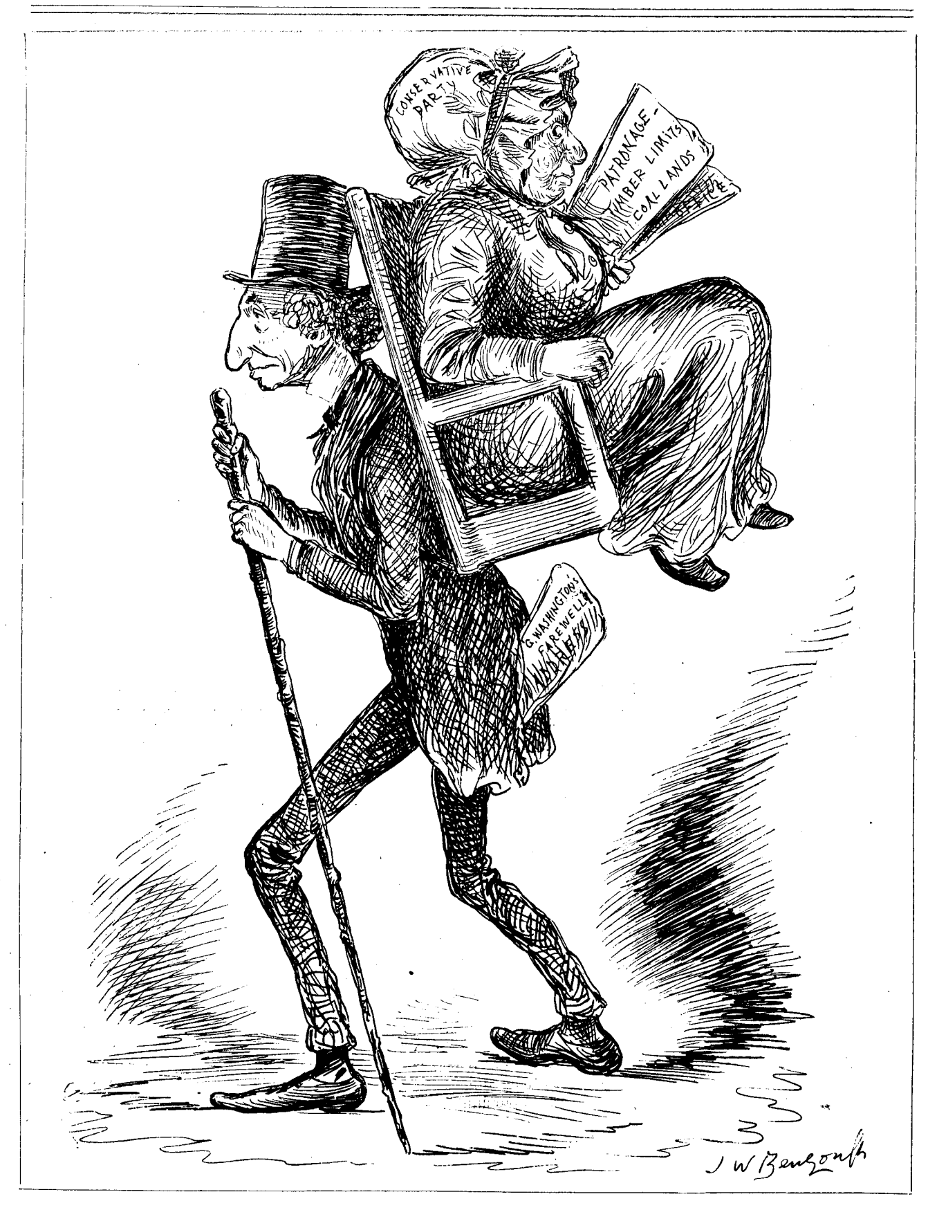
DEPENDING ON ONE MAN.

The Party.-O, PRAY DON'T TALK OF GETTING OLD AND GIVING OUT! I CAN'T ABEAR THE IDEA!