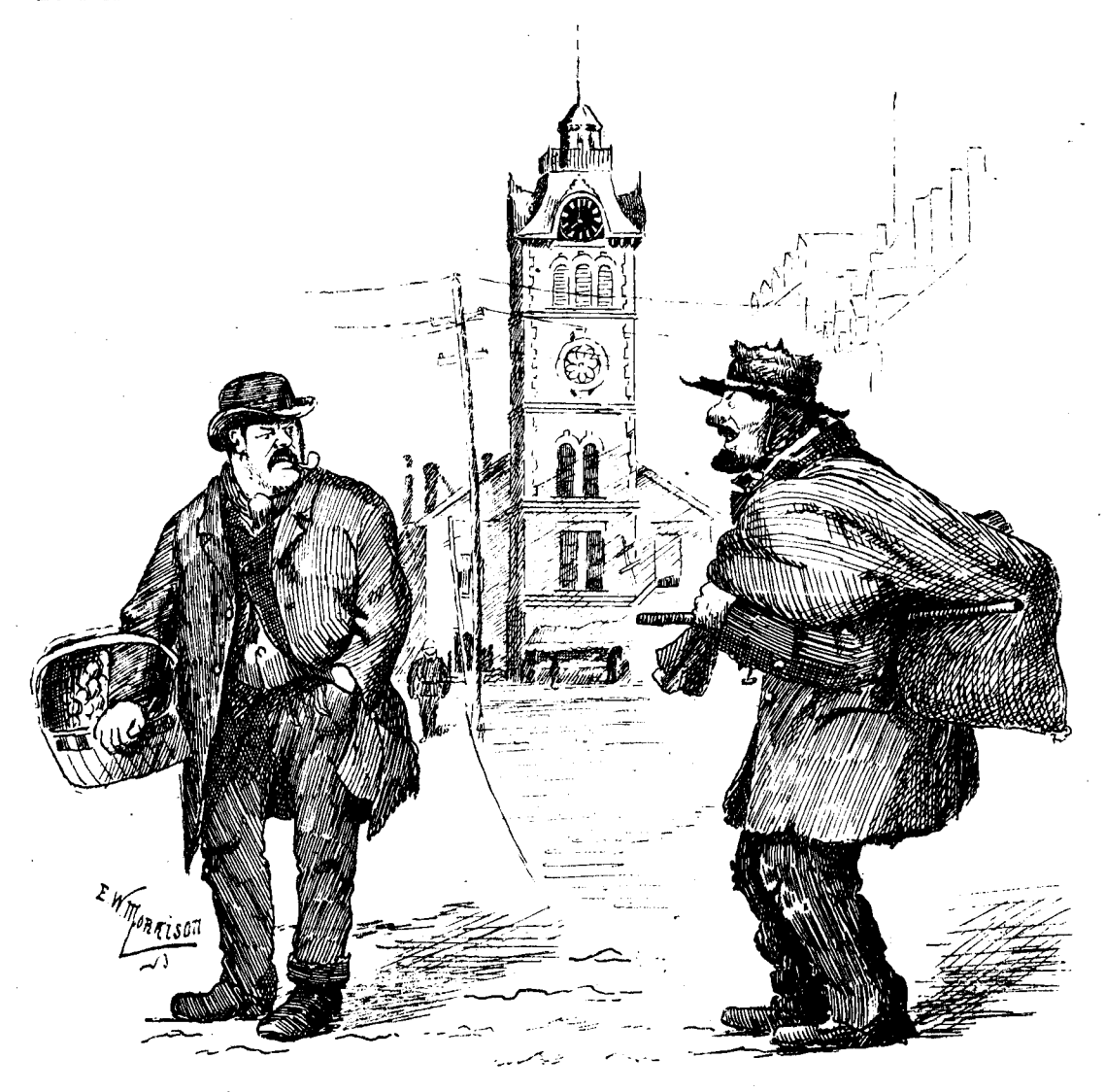
THE NOSES THAT BLOOM IN THE SPRING, TRA-LA.

Old Party.—Hello, Jimmy! I ain't seen ye since last fall. Bedad, if I had ten cents I would treat you. (Insinuatingly) May'be, now, ye've got ten cents yerself?