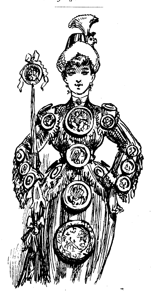
THE LATEST FASHION IN BUTTONS.