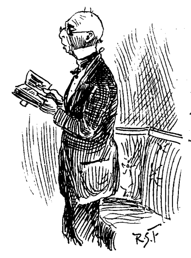
"MY SINS ARE AS MANY AS THE HAIRS OF MY HEAD."