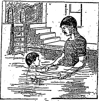
Imitating a Frog.

breast stroke, and, while well under way, suddenly give a reverse stroke with the hands. This will throw you upon your back, and by working the hands with a corkscrew motion you will keep afloat. If you are alone, you may swallow a good deal of water in learning unless you keep your mouth shut; if you have any one to support you, it is very simple. Do not try to raise the head and keep the ears out of the water, as you cannot float in that position. Lie perfectly flat and straight, and in a natural position, as though stretched upon your back in bed In swimming upon the back the legs do most of the work. Kick out with them as n the breast stroke, and paddle with your ands at the same time to keep affoat. When you become expert you can learn to swim very rapidly on the back by stretch ing your hands straight out above the head, lifting your arms from the water to do so. and then bringing them down to your sides with a long, powerful sweep through the