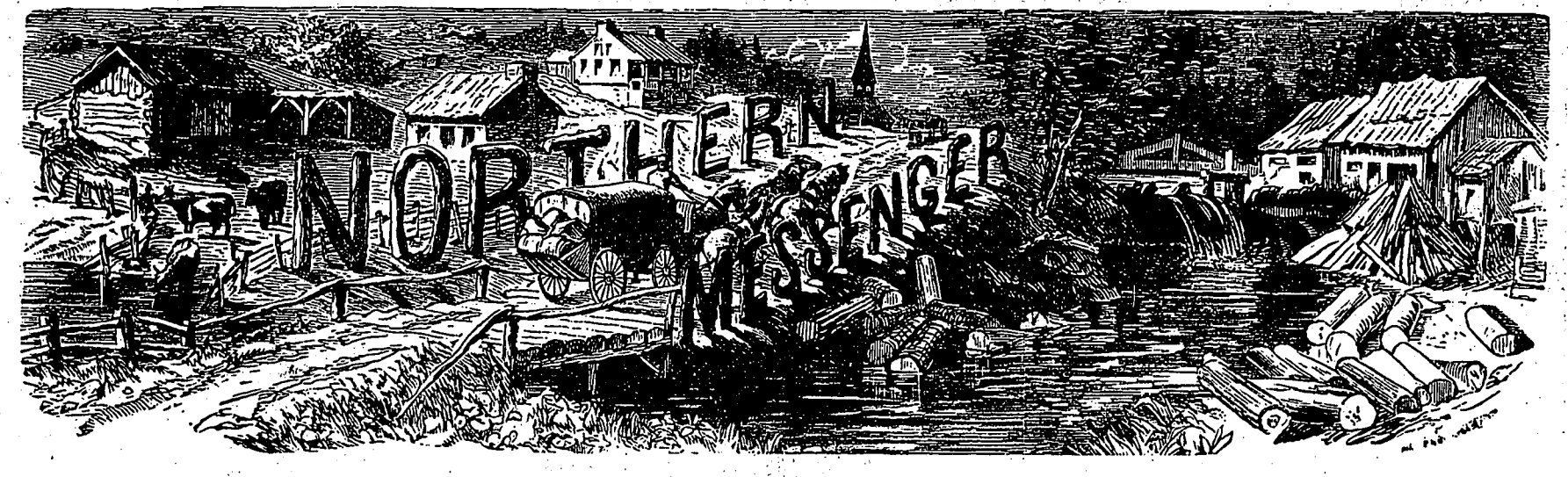
DEVOTED TO TEMPERANCE, SCIENCE, EDUCATION, AND LITERATURE.