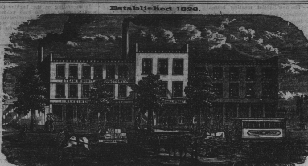
T. RANKINE & SON'S STEAM BISCUIT MANUFACTORY, MILL ST., ST. JOHN, N. B.

IN 1848 Niagara almost ran dry. Scarcely a drop of water was left in the river, and the American side, and the British channel reduced to less than half its ordinary size.