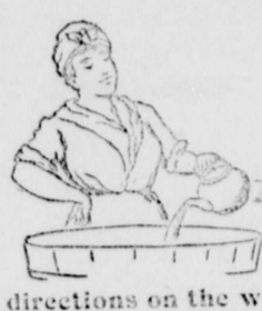
It does away with boiling or scalding the clothes and all that mess and confusion.

is used according to the directions on the wrapper.