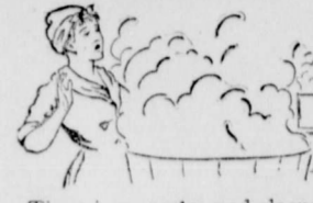
There is an easier and cleaner way.