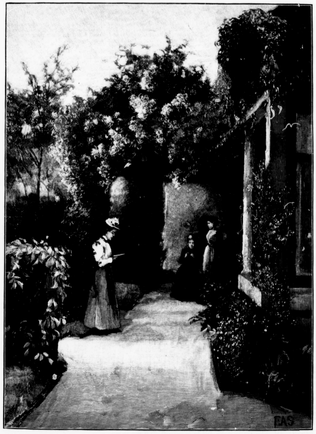
A SUMMER AFTERNOON.