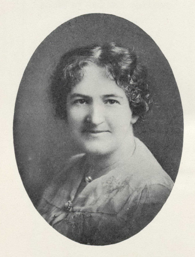
The Author, 1920