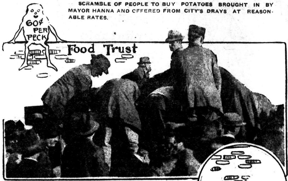
HUMPTY-DUMPTY SAT ON A WALL, HUMPTY-DUMPTY HAD A GREAT FALL; THE MAYOR OF DES MOINES AND ALL HIS MEN WILL NEVER LET HUMPTY CLIMB BACK AGAIN.

An hour later the last 530 bushels had been sold and hundreds of people