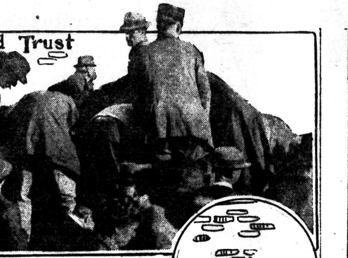
HUMPTY-DUMPTY SAT ON A WALL, HUMPTY-DUMPTY HAD A GREAT FALL; THE MAYOR OF DES MOINES AND ALL HIS MEN WILL NEVER LET HUMPTY CLIMB BACK AGAIN.

who had been unable to get within approaching distance of the wagons were disappointed. The rear of the commission men was long and loud. They accused the mayor of wasting the city's funds to further his own ambition. The mayor showed he had no such a cent, and declared he was going to keep right on selling cheap potatoes until the market was broken.