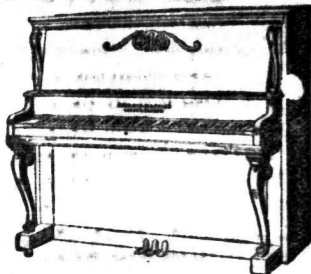
Louis XV. (Style 105)

Chamberlain's Stomach and Liver Tablets do not sicken or gripe, and may be taken with perfect safety by the most delicate woman or the youngest child. The old and feeble will also find them a most suitable remedy for indigestion and for regulating the bowels. For sale by all dealers. 5