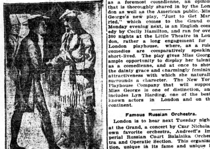
Scene from "The White Squaw" at the Grand Theatre Today.