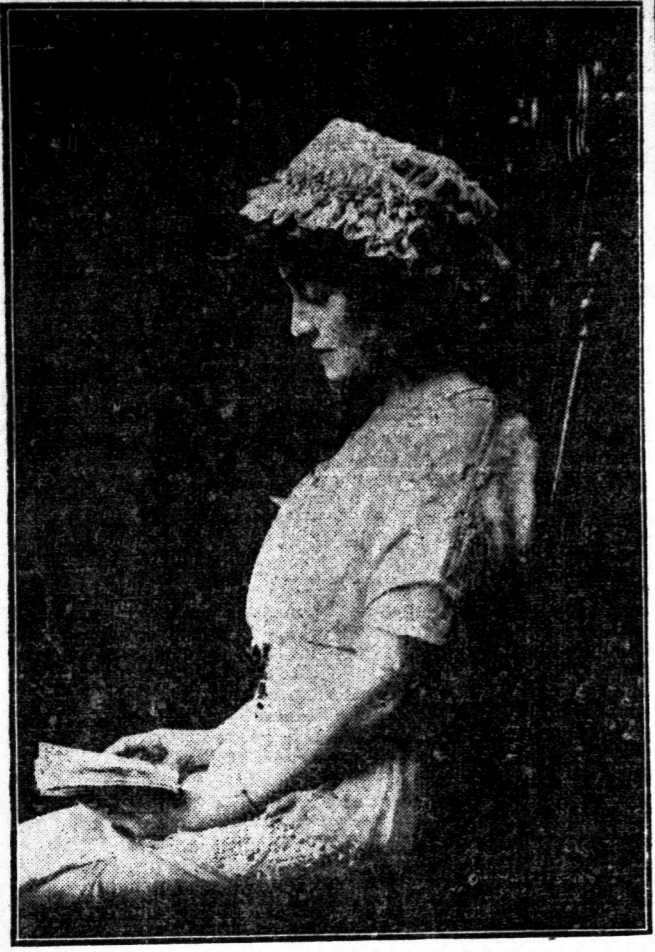
GRACE GEORGE. Who Will Appear at the Grand Monday Evening Next, in Her New Play, "Just to Get Married."