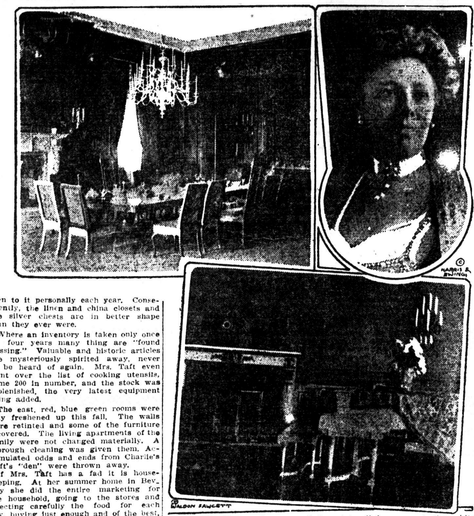
Above, Mrs. Taft and a part of the state diningroom at the white house; below, a corner in the Taft living rooms.

From the "summer white house" at Beverly Farms, Massachusetts, Mrs. Taft has been conducting a correspondence course in full house-cleaning.