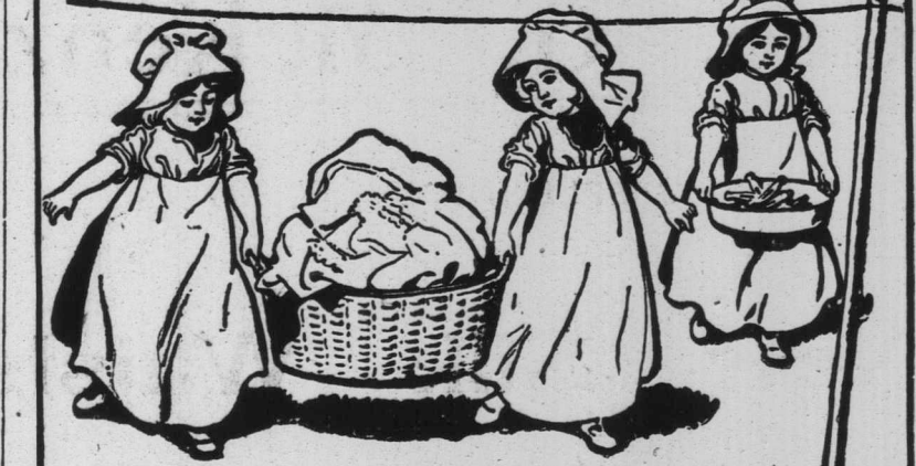
The Sunlight Maids are through their washing by noon—that's the Sunlight way.

5c. FIVE CENTS 5c. LEVER BROTHERS LIMITED, TORONTO