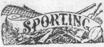
THE RING. WILL MEET IN 'FRISCO.

Parsening business States recognize the "against" a few probing the remarkable few years.