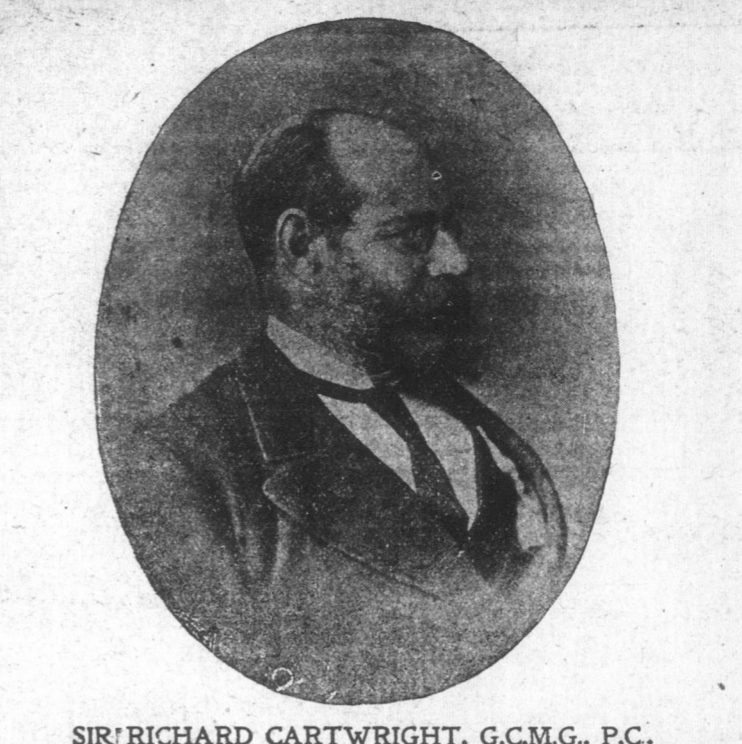
SIR RICHARD CARTWRIGHT, G.C.M.G., P.C. MINISTER OF TRADE AND COMMERCE.

The fire was not discovered until it had gained tremendous headway. Before anybody could ring in the alarm the whole interior of the building was a mass of flames.