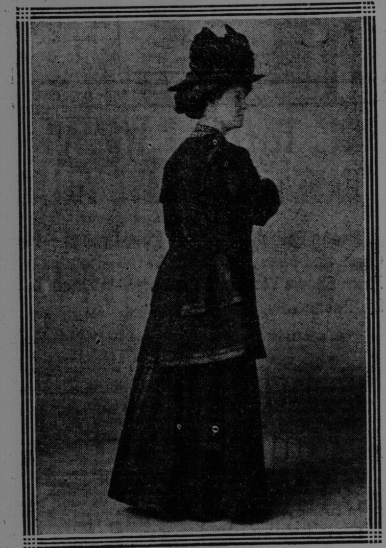
BRAID AND BUTTONS TRIM THE NEW FALL SUITS. The unlimited use of buttons is a feature of the new season. These are depicted anywhere and everywhere, and are not infrequently the sole adornment of the smart tailored suit.