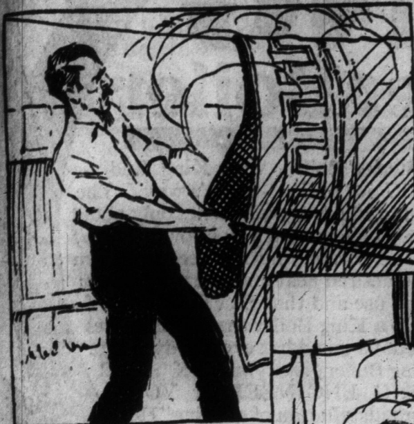
THE OLD WAY

How Do You Welcome It, Mrs. Housewife, With Displeasure or With Joy?