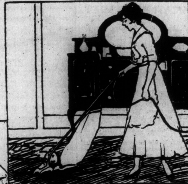
THE NEW WAY

The demonstrations on the Fourth Floor of electric vacuum cleaners and hand-power cleaners, and in the Basement, of electric, water-power and hand-power machines, should all be of special interest to the modern housewife.