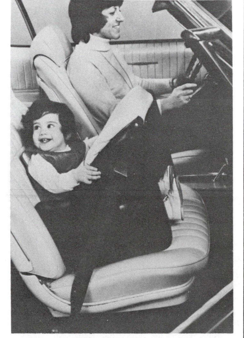
The Guardwell car-safety seat

The lap seat-belt holds the child's seat securely in position but never comes in contact with the child because it passes through openings in the side of the safety seat, which takes all the pull and strain. This