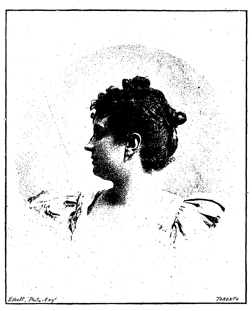
HALF-TONE ON COPPER BY ELLIOTT ILLUS. CO.