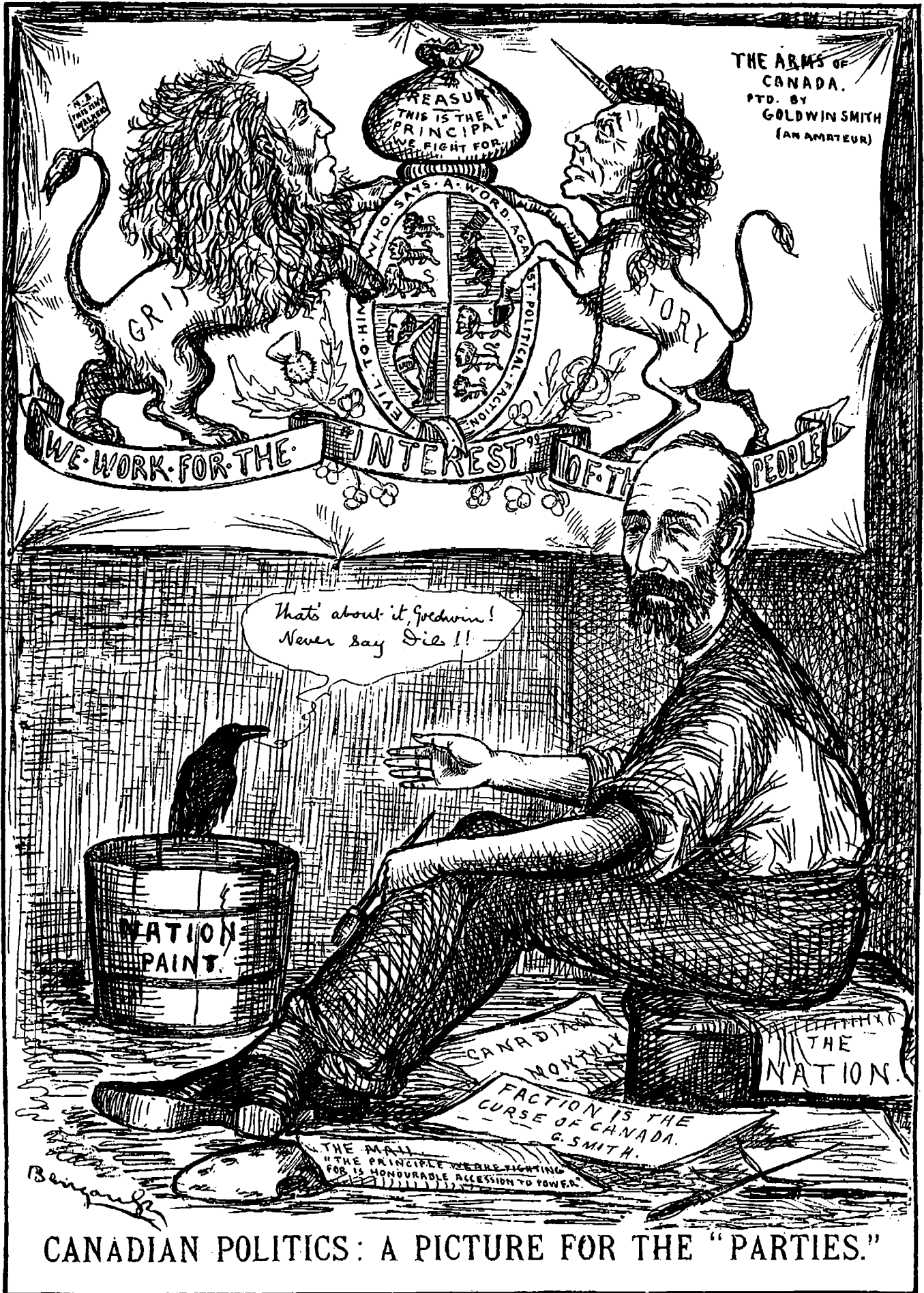
CANADIAN POLITICS: A PICTURE FOR THE "PARTIES."