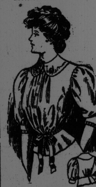
LADIES' BLOUSE DRESSING-SACK.

PERCY J. STEEL, Foot Furnisher 519-521 Main St.