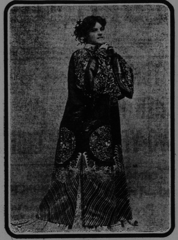
AN EVENING COAT FROM THE ORIENT. It is exquisite hand embroidery, the design of which are repeated in the Mandarin sleeve and the coat from the waistline.