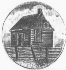
LOG SCHOOL HOUSE, 1835.