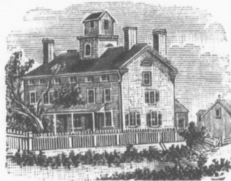
FELLER INSTITUTE, 1840.