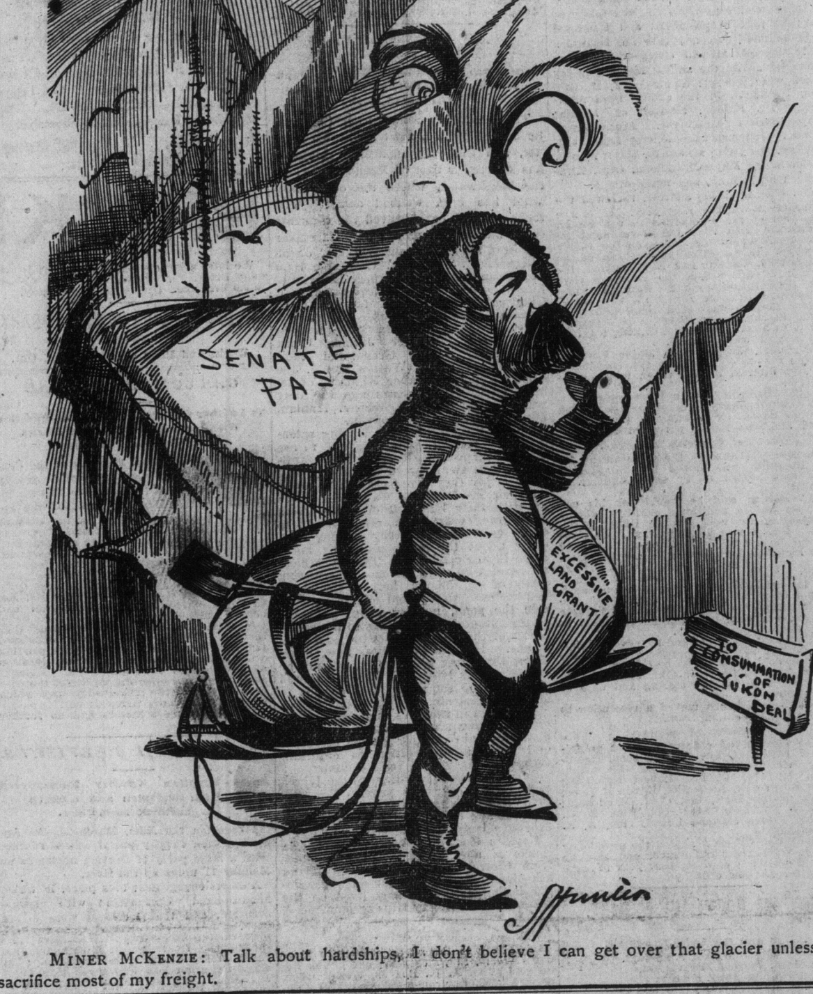
MINER MCKENZIE: Talk about hardships, I don't believe I can get over that glacier unless I sacrifice most of my freight.

So great is the rush of travel westward that the Western Railway train last night went through its eight sections.