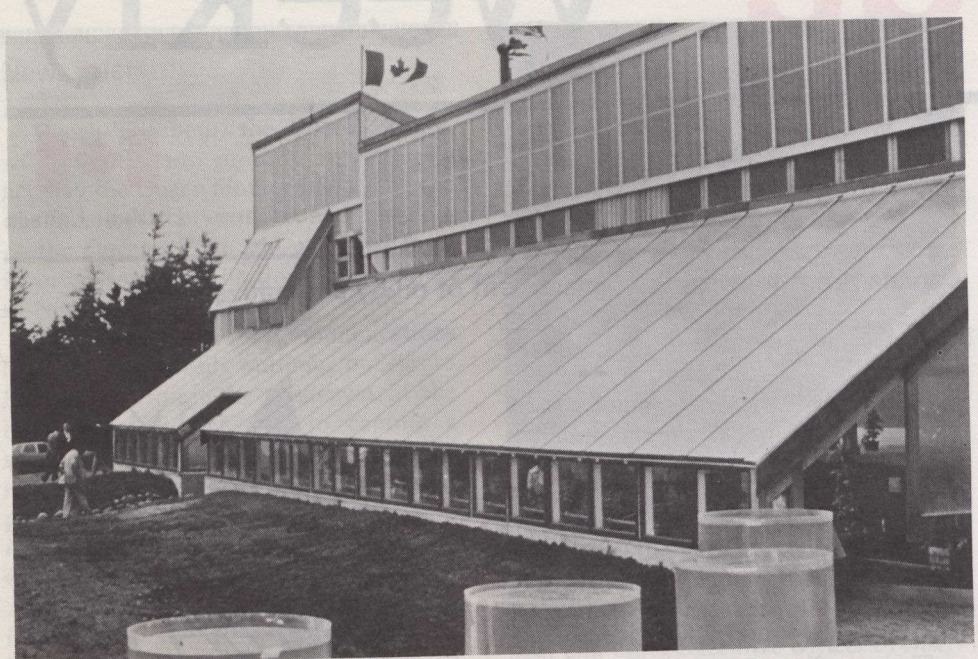
The Ark, a solar house project in Prince Edward Island.

imports may rise in Canada in the next few years but are then expected to decline and drop to zero by 1990, the target-year for Canadian self-sufficiency.