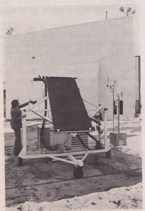
Part of the outdoor test area at National Research Council of Canada's national solar test facility.

sures include the Canadian Home Insulation Program (CHIP), the funding for which has been substantially increased from $80 million to $265 million annually; an expanded industrial energy-audit program; mandatory automobile fuel-economy standards to be established by new legislation and energy-efficient standards that will be applied to new housing that receives federal financial assistance under the National Housing Act.