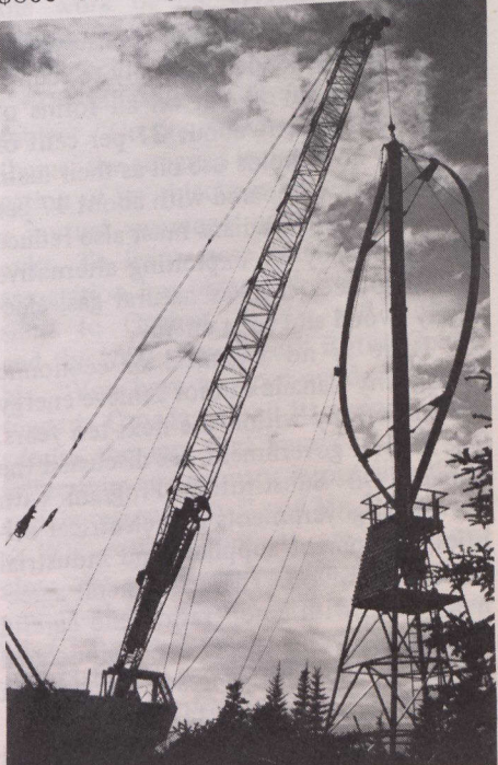
A 50-kilowatt vertical axis wind turbine being erected on Vancouver Island.

The program provides taxable grants covering half the costs of heating-system conversion from oil up to a maximum of $800 for single-family residences. For